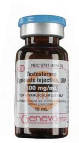
Testosterone Cypionate Injection, USP