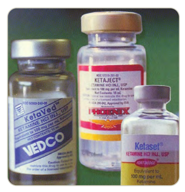
Vials containing liquid ketamine

Ketamine, along with the other "club drugs," has become popular among teens and young adults at dance clubs, musical festivals, and concerts. Ketamine is manufactured commercially as a powder or liquid.