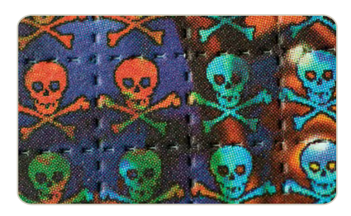
LSD blotter paper

During the first hour after ingestion, people may experience visual changes with extreme changes in mood. While under the influence, the person may suffer impaired depth and time perception accompanied by distorted perception of the shape