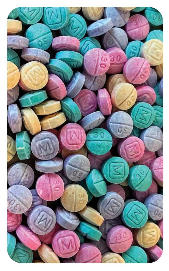
Fake rainbow oxycodone M30 tablets containing fentanyl

Fentanyl is a Schedule II narcotic under the United States Controlled Substances Act of 1970.