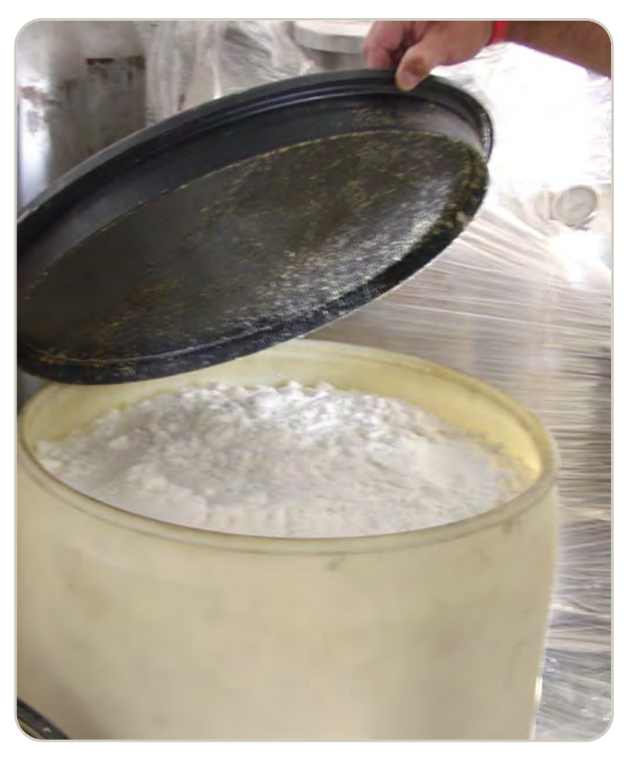
Methamphetamine in finished form

Regular meth is a pill or powder. Crystal meth resembles glass fragments or shiny blue-white "rocks" of various sizes.