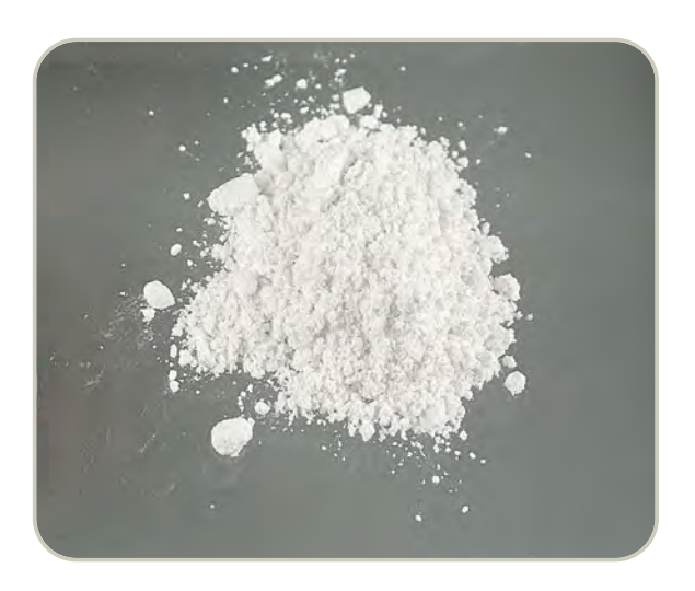
White powder heroin