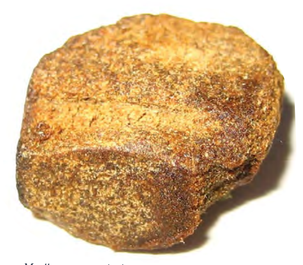
Marijuana concentrate

Many methods are used to convert or "manufacture" marijuana into marijuana concentrates. One method is the butane extraction process. This process is particularly dangerous because it uses highly flammable butane to extract the THC from the cannabis plant. Given the flammable nature of butane, this process has