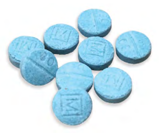
Clandestinely produced fake oxycodone tablets that contain fentanyl.

As of 2013, there has been a re-emergence in the trafficking and use of various clandestinely produced synthetic opioids, including several substances related to fentanyl. Some common illicitly produced synthetic opioids that are currently encountered by law enforcement include, but are not limited to, acetyl