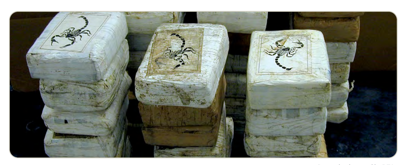
Cocaine bricks, seized by DEA

Cocaine is a Schedule II drug under the Controlled Substances Act, meaning it has a high potential for abuse and has an accepted medical use for treatment in the United States. Cocaine hydrochloride solution (4 percent and 10 percent) is used primarily as a topical local anesthetic for the upper respiratory tract. It also is used to reduce bleeding of the mucous membranes in the mouth, throat, and nasal cavities. However, more effective products have been developed for these purposes, and cocaine is now rarely used medically in the United States.