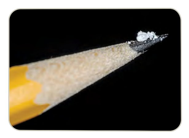
A lethal dose of fentanyl

According to CDC, overdose deaths involving synthetic opioids, excluding methadone were involved in roughly 2,600 drug overdose deaths each year in 2011 and 2012, but from 2013 through 2021, the number of drug overdose deaths involving synthetic opioids, excluding methadone increased dramatically each year, to more than 71,000 in 2021. The total number of overdose deaths for this category was greater than 260,000 for 2013 through 2021. These overdose deaths involving synthetic opioids is primarily driven by illicitly manufactured fentanyl, including fentanyl analogs. Consistent with overdose death data, the trafficking, distribution, and use of illicitly produced fentanyl and fentanyl analogs positively correlates with the associated dramatic increase in overdose fatalities.