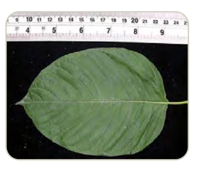
Leaf of kratom tree