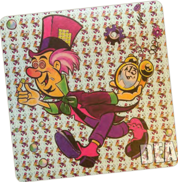
LSD Blotter Sheet