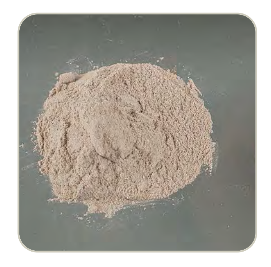
Brown powder heroin