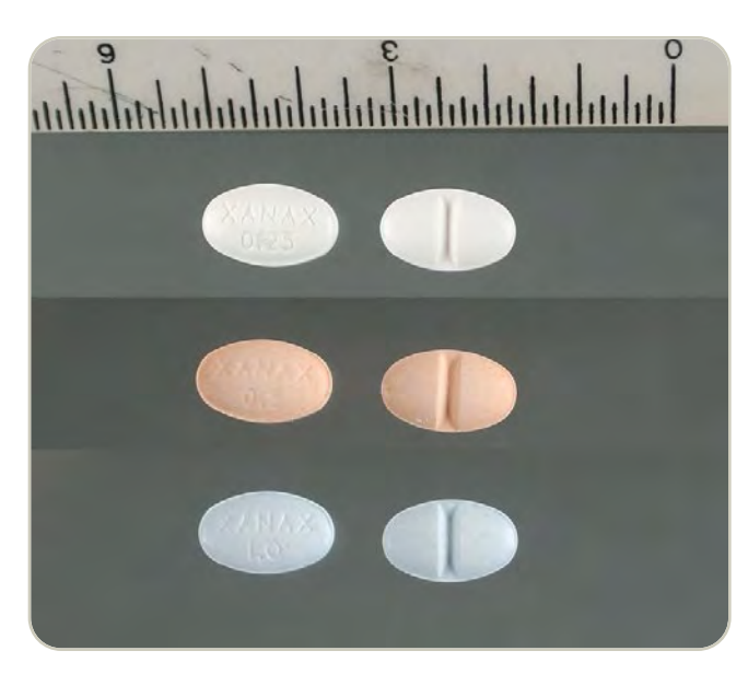
Xanax 0.25,0.5 and 1 mg scored tablets

Generally, legitimate pharmaceutical products are diverted to the illicit market. Teens and others can obtain depressants from the family medicine cabinet, friends, family members, the internet, doctors, and hospitals.