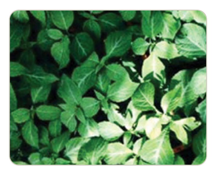
Leaves of the Salvia divinorum plant

The plant has spade-shaped variegated green leaves that look similar to mint. The plants themselves grow to more than three feet high, have large green leaves, hollow square stems, and white flowers with purple calyces.