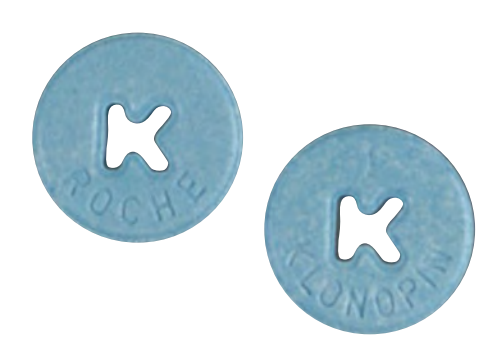
Klonopin 5 mg tablet

Most depressants are controlled substances that range from Schedule I to Schedule IV under the Controlled Substances Act, depending on their risk for abuse and whether they currently have an accepted medical use. Many of the depressants have FDA-approved medical uses. In the United States, Rohypnol® and Quaaludes® are not manufactured or legally marketed, and have no accepted medical use.