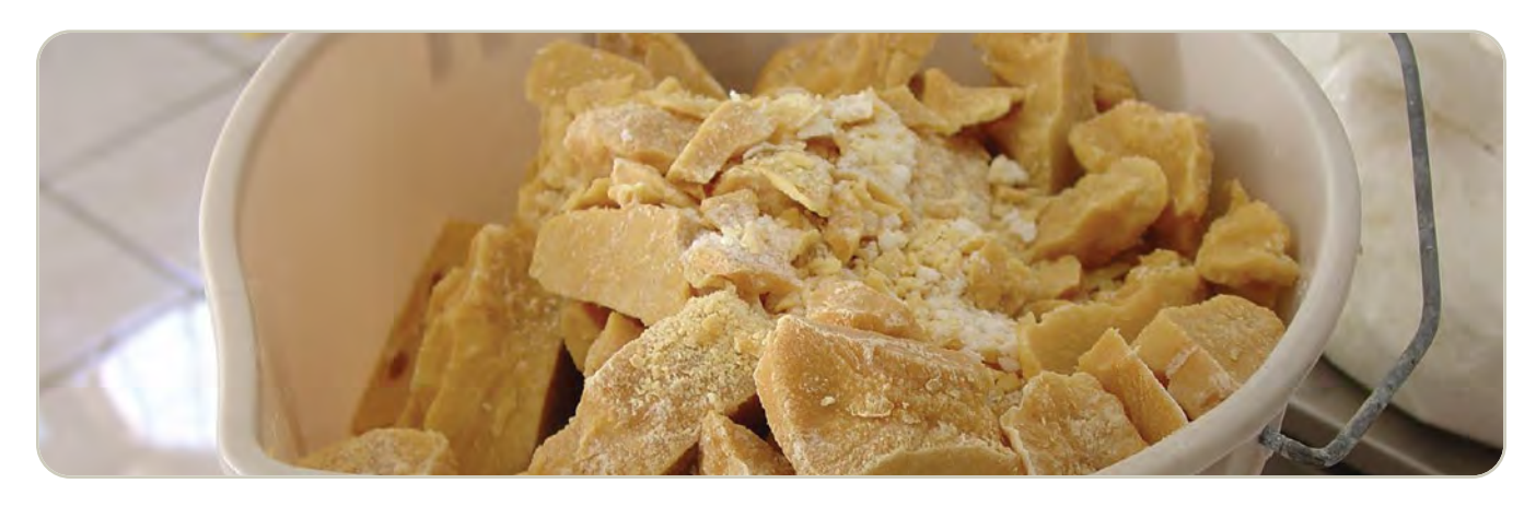
Me tham phe tamine\ in\ finished\ form

Methamphetamine is a Schedule II stimulant under the Controlled Substances Act, which means that it has a high potential for abuse and a currently acceptable medical use (in FDA-approved products). It is available only through a prescription that cannot be refilled. Today there is only one legal meth product, Desoxyn®. It is currently marketed in 5 milligram tablets and has very limited use in the treatment of obesity and ADHD.