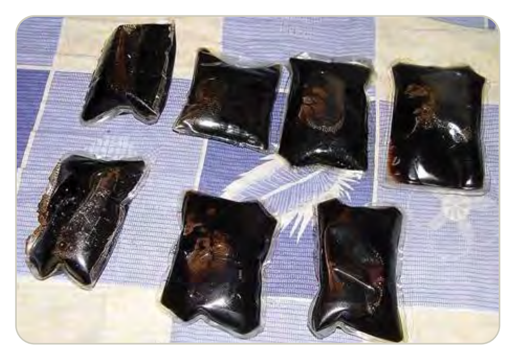
Heroin liquid packets